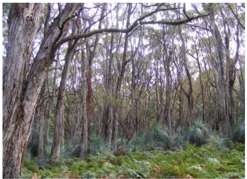
Figure 3: Small diameter regrowth in the 1937 cleared sites (photo 2012).