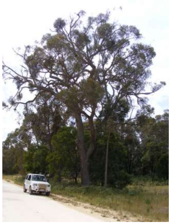
Figure 4: Large diameter remnant tree on firebreak on Grundy Lane, North of reserve (photo 2015).