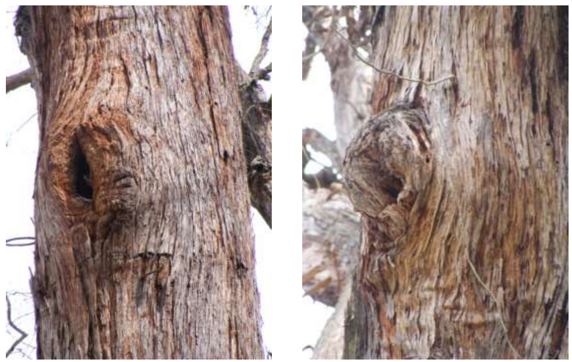
Figure 5: Broken branch tree hollows on tree from Plate 4 (photo 2015).